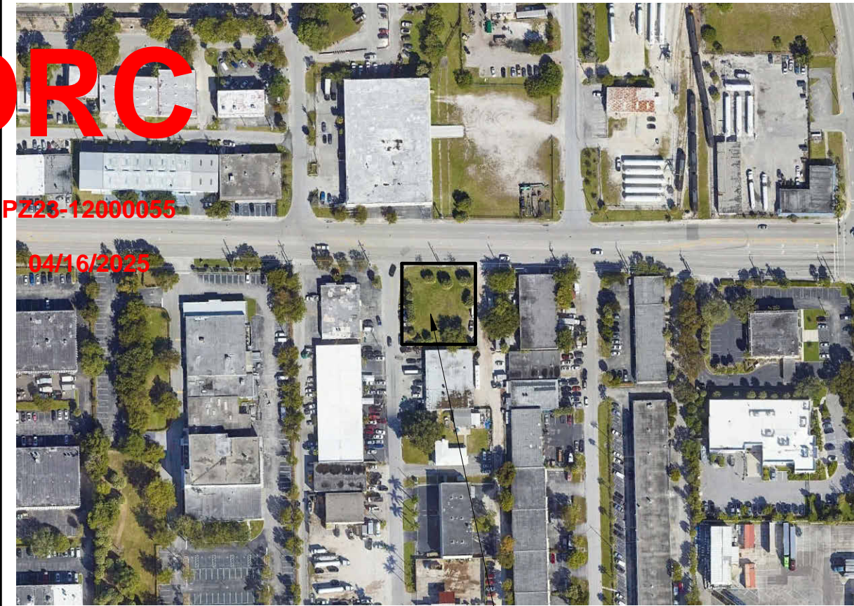
VACANT PROPERTY, SW 3RD STREET, POMPANO BEACH, FL.

1. WORK PERFORMED SHALL COMPLY WITH THE FLORIDA BUILDING CODE 2023-8th . EDITION, FLORIDA FIRE PREVENTION CODE 2023 (8TH EDITION), WITH BROWARD COUNTY AMENDMENTS. NFPA-1 & 101, 2021 EDITION, APPLICABLE STATE AND LOCAL CODES, ORDINANCES AND REGULATIONS.